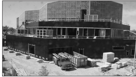
A building committee helped oversee a new facility for Fountaindale Public Library, now under construction and set to open February 2011.

Part of the rationale behind this series of columns is for me to explore all of the different things that I experienced as a new Trustee, including some issues that all happened to occur early in my tenure that many Trustees may never have experienced at all, even with many years of on the board. Since