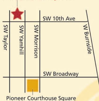
Multnomah County Central Library & the Friends' Library Store

Trimet routes: MAX and trolley drop you right at our door. You can also reach us on any bus labeled "TO PORTLAND."