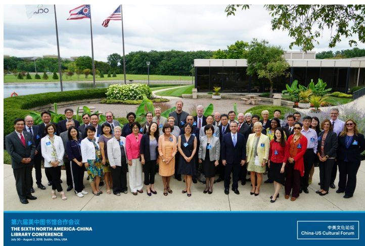
Participants at the 6th Conference

Have you participated in an international conference? Consider sharing about your experience with IRRT readers!