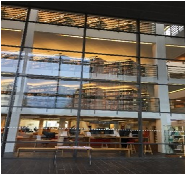
University of Borås Library

Besides working with faculty about school librarianship curriculum, I guest lectured in three courses, conducted a research seminar on fake news, presented about school librarian preparation on a regional library conference, and presented a workshop on actively engaging students, especially in online learning environments.