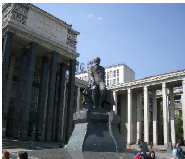
The 175 years old Russian State Library (former Lenin Library) in Moscow with the Fedor Dostoevsky Statue.

The city of Pskov was a wonderful site for the conference. The city has a rich history and was celebrating the 1100 th anniversary of its founding this year. We were able to visit many interesting places, including a number of academic, public, and school libraries. We also had the opportunity to talk to many librarians from all parts of Russia who were able to tell us about what was happening in libraries in their part of the nation, and who were very interested in what we had to say about U.S. libraries. Like most of the other attendees, we traveled to the conference by train. One of our lasting memories will be the train ride from Pskov back to Moscow. The train left the station at Pskov in the early evening for the overnight trip. The train was almost completely full of librarians. There was car after car filled with them.