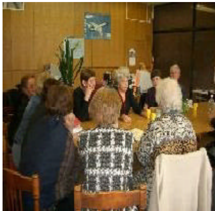
A meeting with the librarians at MGIMO.