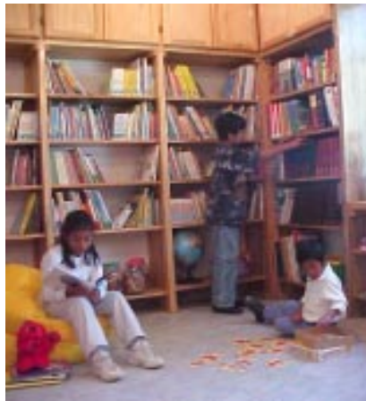
A small school library in Antigua.

When I started my work there, the library staff told me they wanted to develop an online library catalog for the collection. Previously, a volunteer had created a bibliographic database for the library but records had been entered inconsistently and it had not been updated or maintained for some time. The only current catalog the library did have was a card system that included only minimal information. They used the Dewey Decimal classification system for shelving, but their card catalog records had no subject terms and