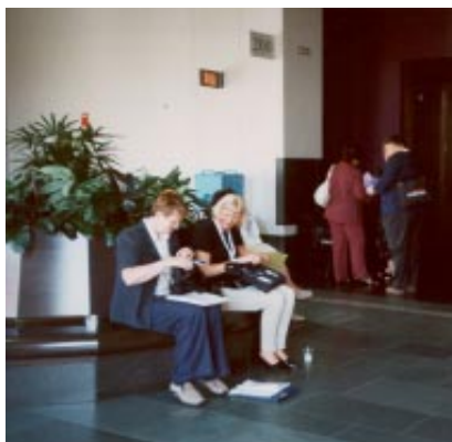
Conference attendees review materials they received between the meetings.

In order to serve on the IFLA committees, it takes years of work with the organization. I have served as the ALA representative to the IFLA Section on Statistics since 1995. My representation is sponsored by the ALCTS Library Materials Price Index Committee (LMPI) and the L A M A Section on Measurement, Assessment and Evaluation. After that, I served as interim chair of the Statistics Section in 1998, was elected chair for 1999-2001, and re-elected chair for 2001-2003. As chair of the Statistics Section, I chair the Section's two open meetings and organize an open