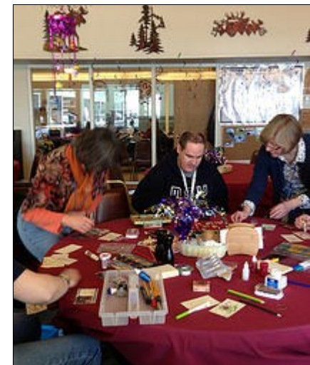
Librarians assisting at a Senior Center. Anchorage, Alaska 2012