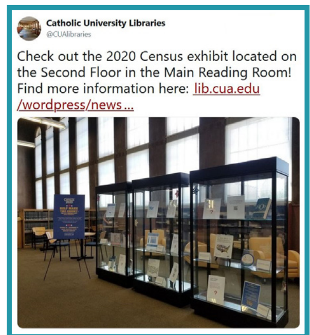
Catholic University of America Libraries created an exhibit to raise awareness.

Provide computers and internet access: Students and other library users may find it convenient to fill out the online Census form at the library. For instance, the library at California State University, Monterey Bay will have a table with Census information next to computers where library users can respond to the Census online.