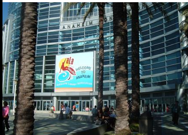
Anaheim welcomes the Librarians