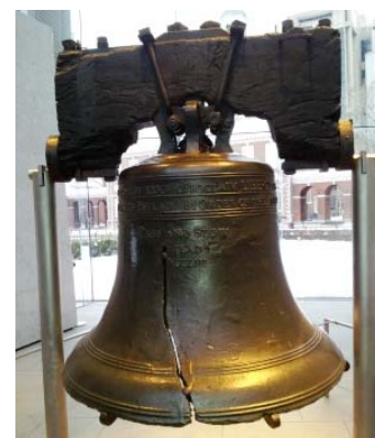
The Liberty Bell