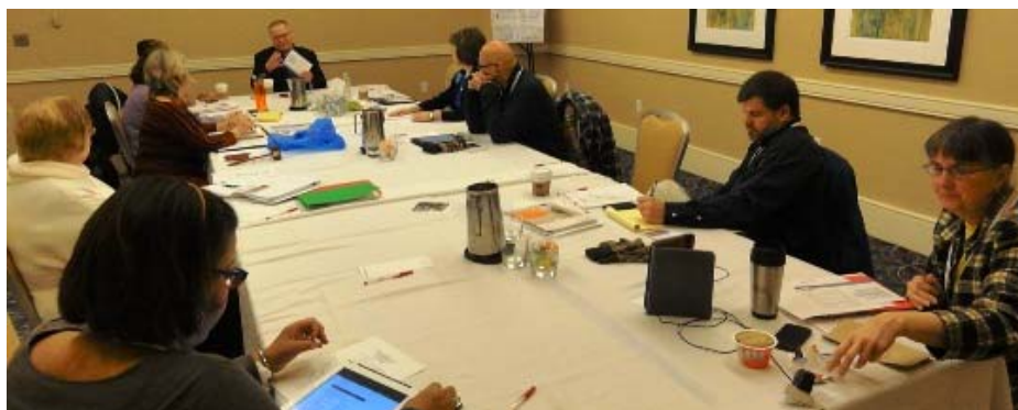
LSSIRT Steering Committee meeting at ALA Midwinter in Philadelphia