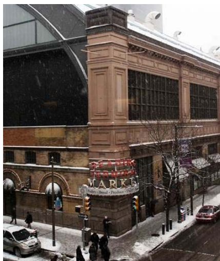
Reading Terminal Market