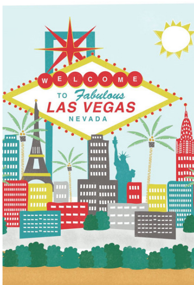
Las Vegas, Nevada

Library Support Staff Interests Round Table Membership and Steering Committee Meeting Las Vegas Convention Center, Las Vegas, Nevada June 25, 2014.