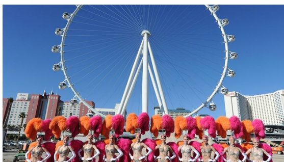
World's Tallest Ferris Wheel called the High Roller opened in Las Vegas in March of 2014.