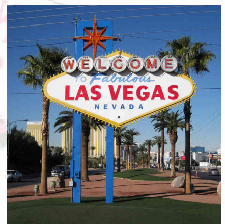
Welcome to Fabulous Las Vegas!