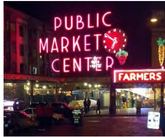
Pike Place Market