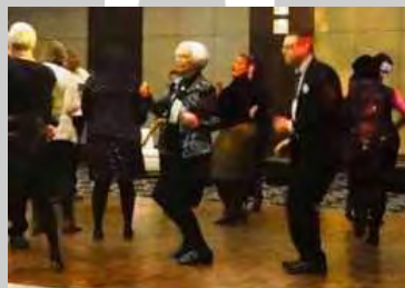
The ALA-APA networking event featured a live DJ, good friends and good times