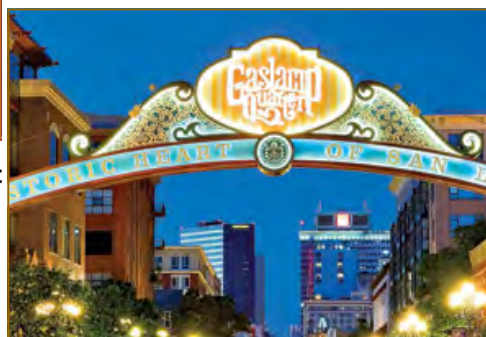
Entrance to the Gaslamp District