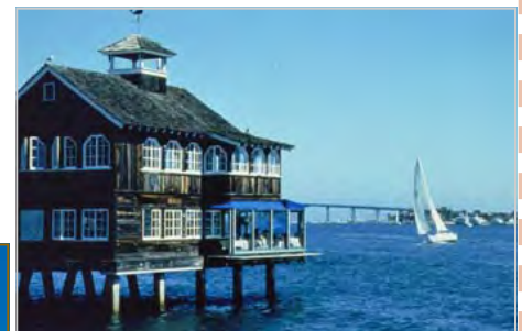
Pier Café at Seaport Village