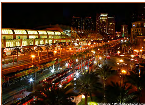
San Diego Convention Center at night with the trolley station