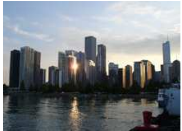
Chicago skyline from Navy Pier