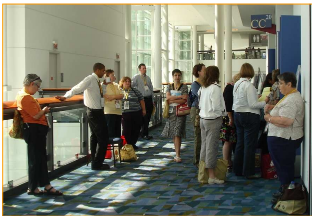
Empowerment Conference attendees await the next session