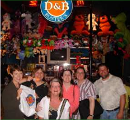
LSSIRT Night Out at Dave and Busters