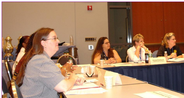
LSSIRT Steering Committee Members