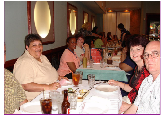
LSSIRT Night Out at the City Lights of China