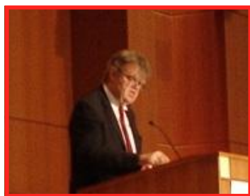
Garrison Keillor at ALA Annual Conference in Washington D.C.

We had to sneak in the back entrance to get a seat at the Closing Session, but it was worth it! Garrison Keillor treated the standing-