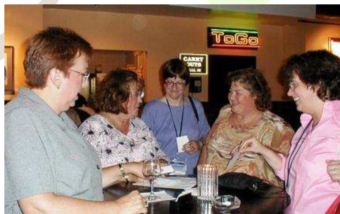
LSSIRT Night Out at Leona's Restaurant delivered good food and good friends.

McCormick Place Chicago is comprised of four state-of-the-art buildings with 2.6 million square feet of meeting space. ALA Annual Conference 2009 and the Empowerment Conference 2009 will be held here.