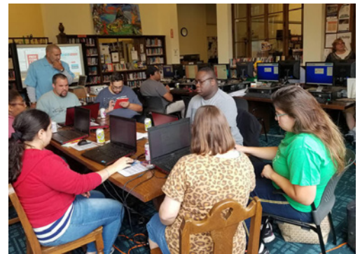
Digital skills workshop at the library

serve low income working parents and their families. Providence Community Library’s other mobile library, the Every Place Makerspace, brings creative tools and workshops to schools and recreation centers across Providence. Additionally, the library is growing efforts to reach adult daycare centers as well as elderly and disabled housing units to offer tech support, maker space activities, and circulation of materials. 🇺🇸