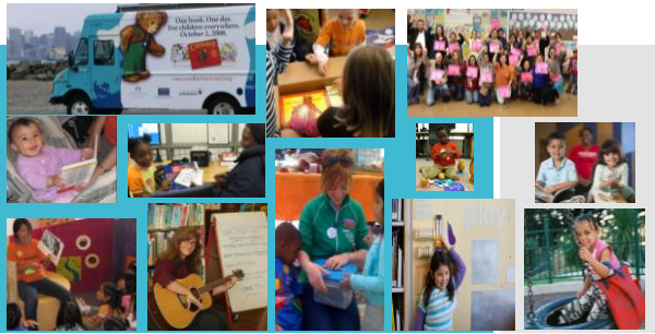
SF EARLY LITERACY NETWORK