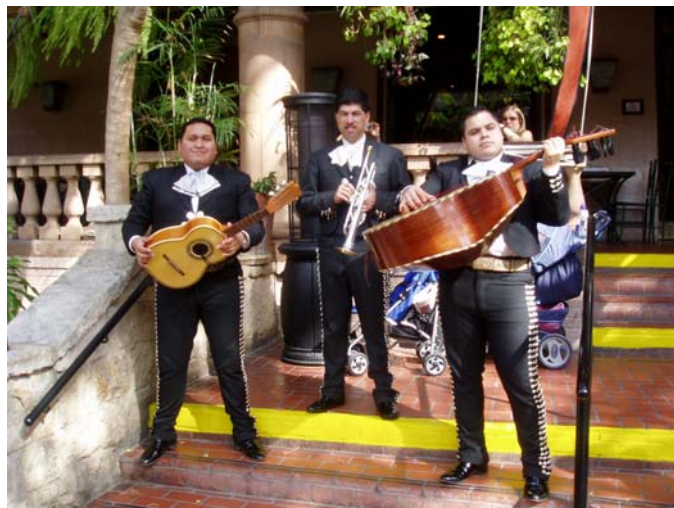
Mariachis at Casa Rio on the Riverwalk