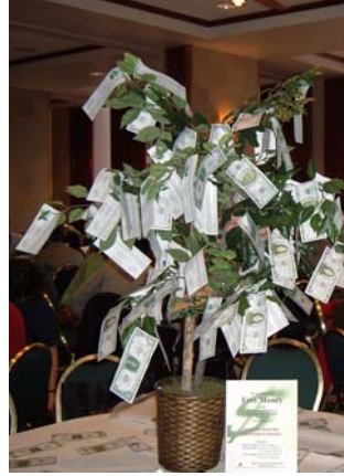
The “Money Tree” makes a Consolidated meeting appearance at Midwinter