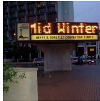
San Antonio welcomes ALA

While there was no easy answer, the group found the discussion helpful. There was also the suggestion that small groups of librarians meet informally with vendors at conventions so that they can make their needs known.