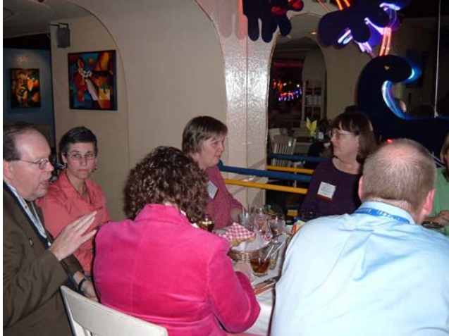
Members met at Ibiza Patio Bar and Restaurant at the Palacio del Rio on the Riverwalk for the EBSS Saturday night Social.