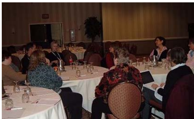
Discussion group after Consolidated Meeting, Midwinter

(collect development and retention polices on tools, guide on doing one on one consultations, grants, foundations, scholarships and loans, resources for dealing with questions from administrations, datasets, and reference tools).