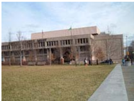
The U.S. Mint in Philadelphia

We want to include your CMC in this directory so don't hesitate to contact us to get CMC included in the updated directory. Feel free to distribute this notice.