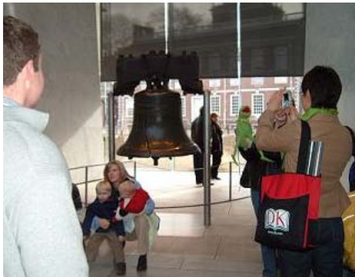
Taking pictures in front of the Liberty Bell.