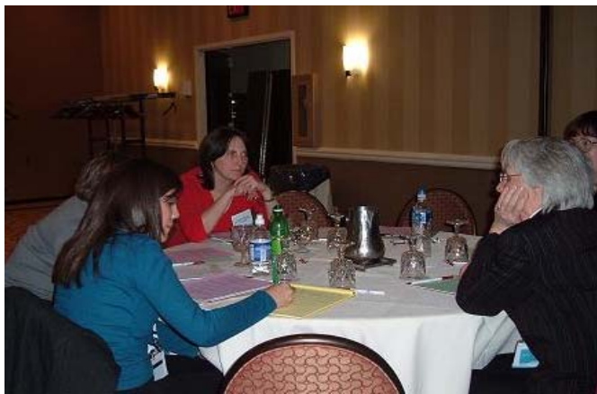
Committees gather at the EBSS Consolidated Meeting