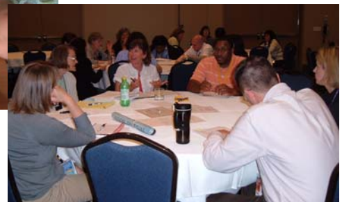
It wouldn't be ALA without committee meetings