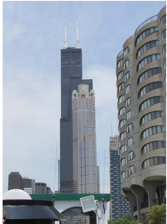
Chicago landmark, the Willis Tower (formerly the Sears Tower)

Reference Sources and Services Committee is putting together an article for C&RL News (More information is on page 7). The article covers