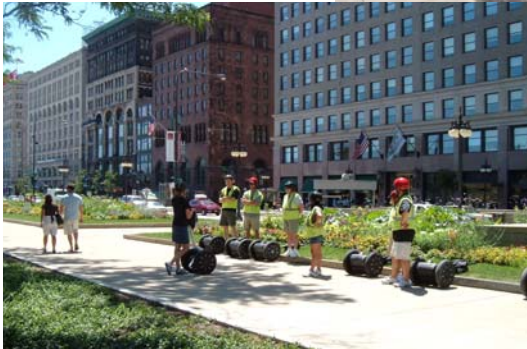
Preparing for the Segway Tour of Grant Park