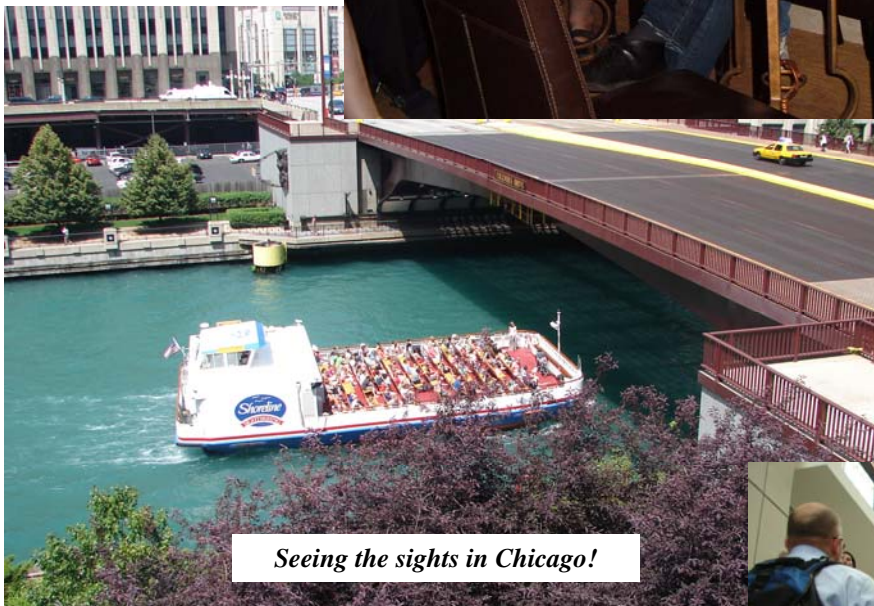
Seeing the sights in Chicago!