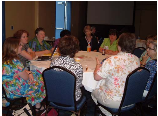
Curriculum Materials table at the EBSS Consolidated meeting

Social Work/Social Welfare Committee started with literacy standards and open access on their agenda. Their information literacy standards include completed drafts, with others still in process. They also discussed open access journals and how to get needed information to library users.