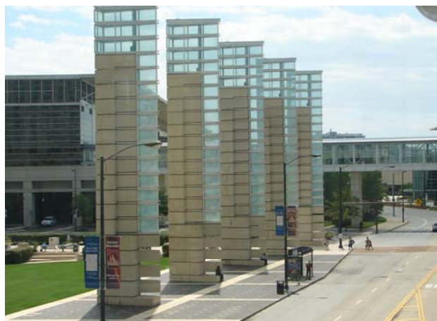
Chicago welcomes the librarians