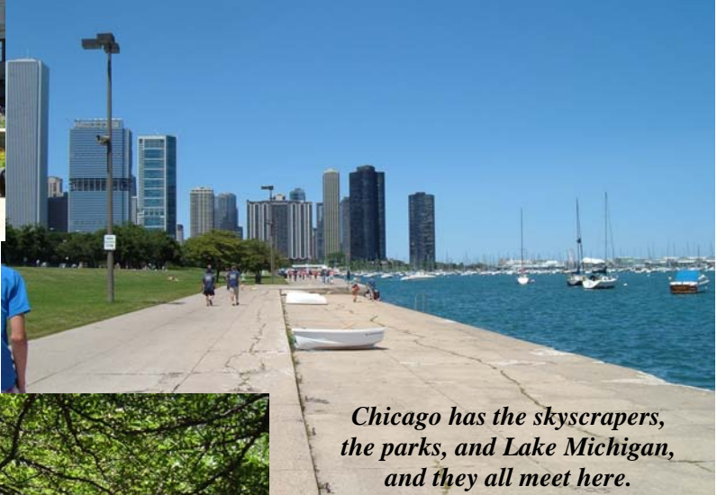
Chicago has the skyscrapers, the parks, and Lake Michigan, and they all meet here.