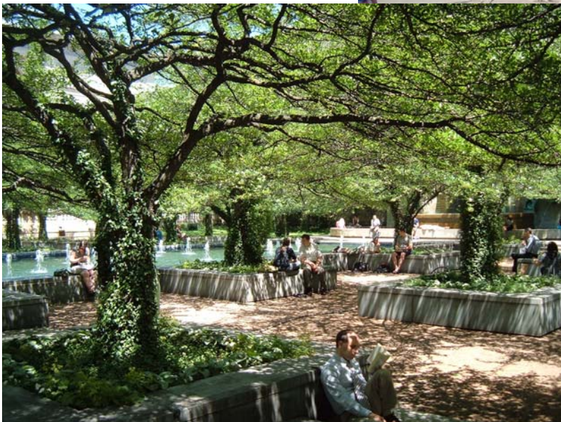
The park by the Art Institute of Chicago