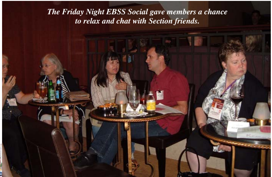
The Friday Night EBSS Social gave members a chance to relax and chat with Section friends.