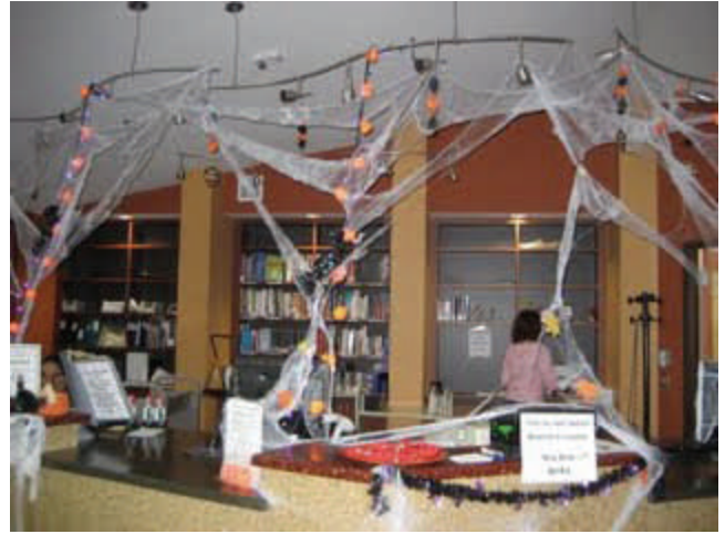
The circulation desk at Northwest Vista College is ready to check out ghosts and goblins this Halloween. An informal contest was running in the library between the Circ, Ref, and Computer Help Desks. See the Library Lowdown blog on their home page for more info.