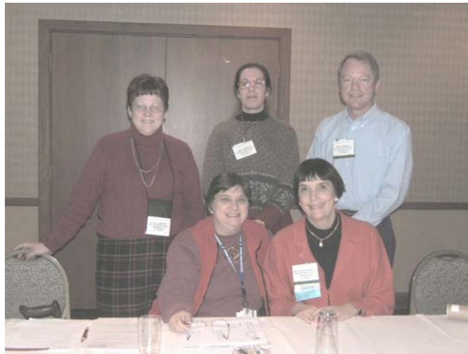
CJCLS AWARDS COMMITTEE