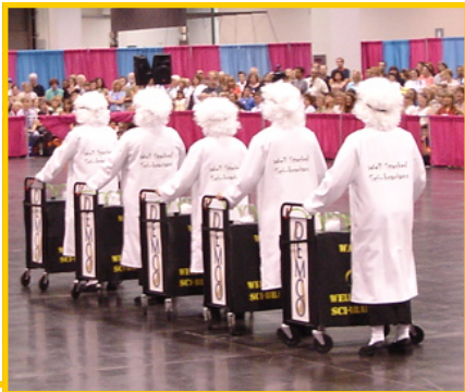
“Well-Stacked Cybrarians” from Santa Monica (CA) win the Book Cart Drill Team competition. View the entire YouTube video here: http://tinyurl.com/6jgg5g