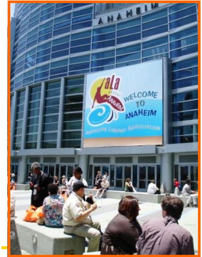
Anaheim Convention Center