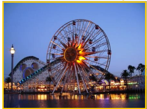
Disneyland's California Adventure Park