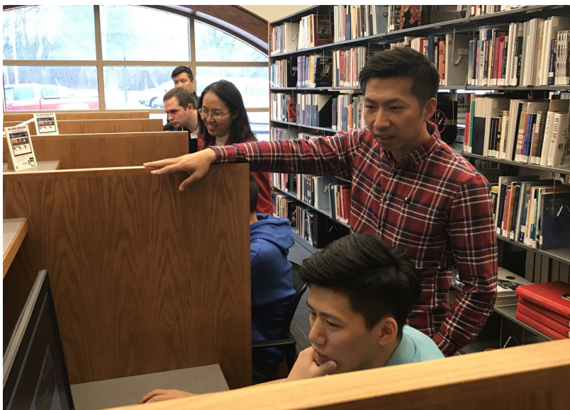
Firefighters from Hong Kong visiting the IFSI Library.

Excellence award, the SLA Diversity Leadership Development Program award, the Outstanding Contribution Award of the Association of University and College Libraries, the Library Society of China, JCLC Advocacy Award at the 2018 Nation-