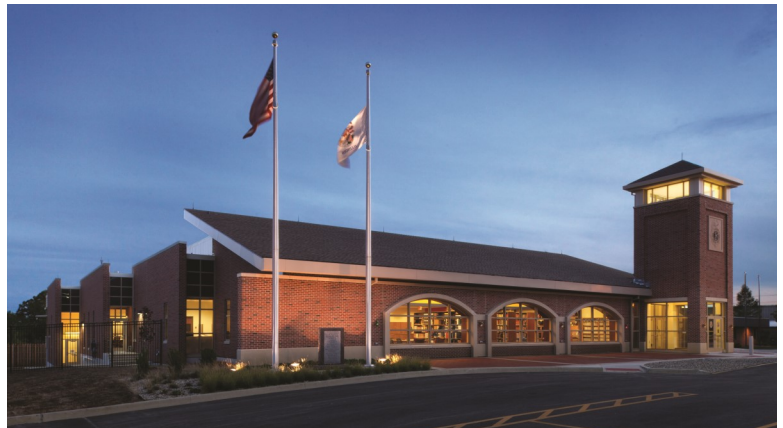
The Illinois Fire Service Institute Library.

In addition to serving fire service organizations, firefighters and other emergency responders, IFSI staff and instructors, University of Illinois faculty and students, the library hosts visiting international scholars, 20 currently, who use the library resources to conduct scholarly research, attend and give professional presen-