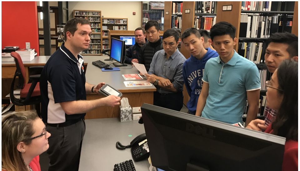
Firefighters from Hong Kong learn about the resources at the IFSI.

Do you work for an American library that has international involvement? Share your story with colleagues in the next International Library Profile!