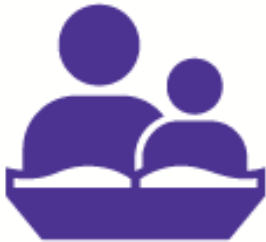
EARLY CHILDHOOD LITERACY