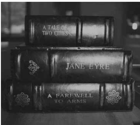
Figure 1. Hand-painted, leather-covered drawers made to resemble books, ca. 2004. Jane Eyre Collection, Rare Book School.

A theme that constantly recurs through the collection is that of the “old book.” For example, Rare Book School owns a small set of leather-covered drawers, circa 2004, that were made to resemble three leather-bound volumes stacked one atop another (see figure 1). The titles of the “books” are hand painted in gold and the “spines” most likely intended to imitate hand-tooled bindings (though considering the