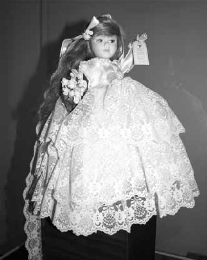
Figure 3. “Jane Eyre” doll created by Robin Woods in 1990. Jane Eyre Collection, Rare Book School.

academic radar. For example, many people recognize Jane Eyre not as an orphan or governess, but simply as a bride. Take for example the Jane Eyre doll, dressed in full wedding costume, which was designed in 1990 by Robin Woods (see figure 3). Or a