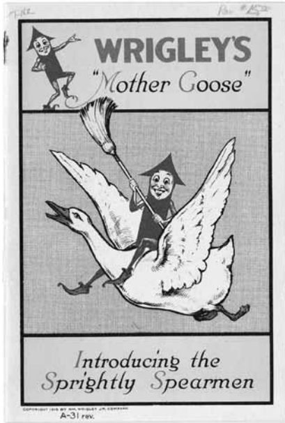
Figure 3. Wrigley's "Mother Goose": introducing the Sprightly Spearmen. Chicago: Wm. Wrigley Jr. Company, 1915. Special Collections Research Center, University of Chicago Library.