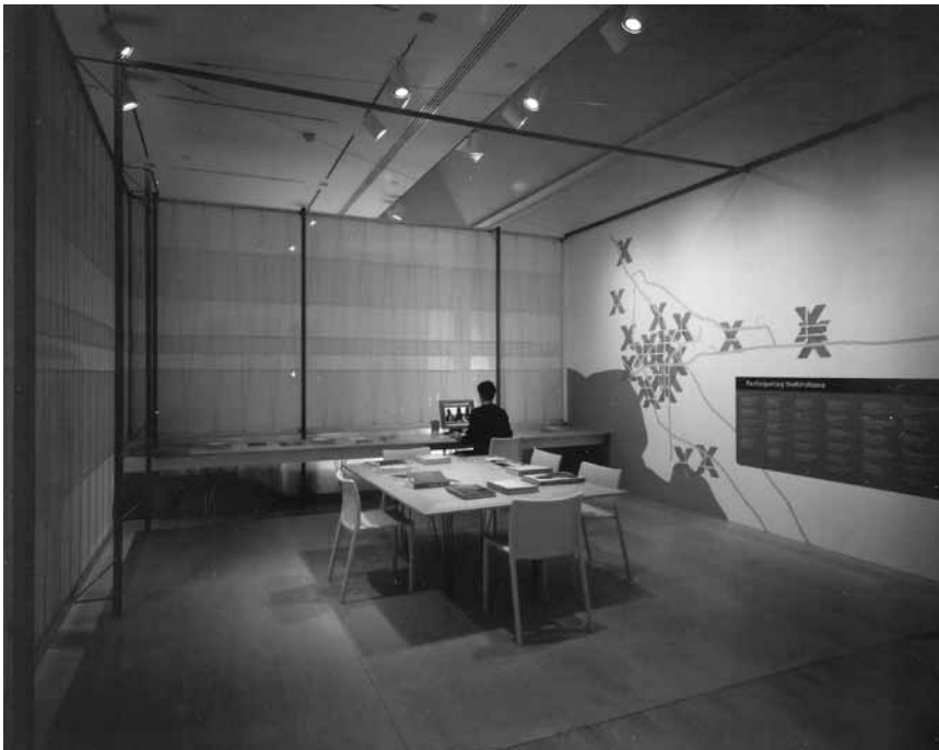
Figure 2. Installation view of The World from Here: Treasures of the Great Libraries of Los Angeles , Hammer Museum, Los Angeles. October 17, 2001–January 13, 2002.

Two recent exhibitions, both mounted in Los Angeles in 2001, broke new ground on several levels. Though differing greatly from one another in content and context, each enjoyed notable success. Their popularity and broad appeal was arguably attributable to the innovative characteristics they shared, including a highly eclectic selection of materials and objects, the deliberate choice to display “library” and other nonart objects in a museum setting, their inventive installation designs, and their extensively illustrated and creatively designed scholarly catalogs, both of which won awards. On their closing days, both exhibitions were crowded with many return visitors—an important measure of audience impact.