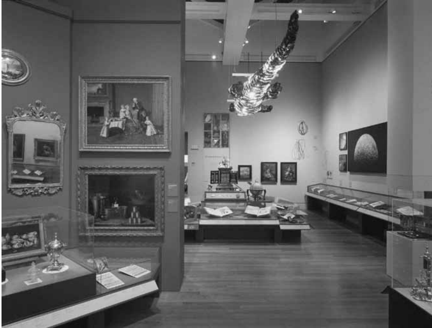
Figure 3. Installation view of Devices of Wonder: From the World in a Box to Images on a Screen, J. Paul Getty Museum, Los Angeles. November 13, 2001–February 3, 2002. With permission of the J. Paul Getty Museum and the Getty Research Institute.