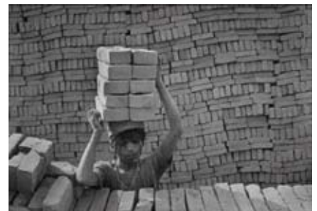
Stolen Dreams; Portraits of Working Children.

personal impact? What is the effect of the sharply lit oyster shells and unending stacks of bricks? Some may focus on their "personal lens" by sharing their qualms about climate change or work