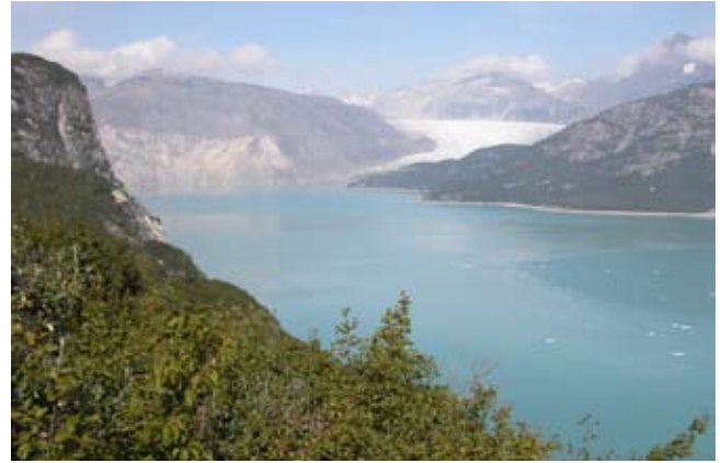
Muir Glacier in 2004

to share what they've learned, as well as their feelings, opinions, and questions about the photographs. Our values, emotions, and knowledge shape our responses to a photograph, just as they inform our responses to a printed text and indeed every experience in our lives. Using the Perspectives Chart (previous page), ask for elaboration of responses and add questions that prompt further thinking. Does the visual evidence of glacial retreat have a