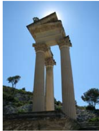
Glanum, Saint-Rémy-de-Provence.