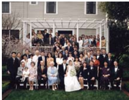
Wedding Party

Yet the premise of documentary photographs, whether they are of a wedding, an inauguration, a mutation, or a news event, is that they are truthful representations of reality. Arnheim says of them: "We are on vacation from artifice," (as quoted in Steiner 1995, 40). Indeed the events did happen: we were there to see this couple get married (below); Lincoln was inaugurated on the steps of the Capitol (right); the scientific paper provides experimental evidence of the mutations in zebrafish embryos (bottom right); and Buddhist Monks were severely injured in recent demonstrations in Burma (next page). Similarly, anthropologists and sociologists have used photographic inventories of objects, people, and artifacts, images from the past of institutions or individuals, and intimate images of a social group in support of anthropological field studies or sociological