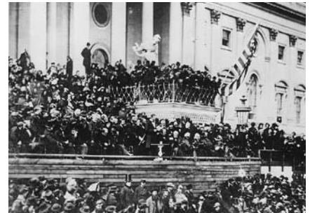
Abraham Lincoln giving his second inauguration address. American Memory, Library of Congress Prints and Photographs Division, Washington D.C.

altered the photographs he took for the National Child Labor Committee, recognized that his own perspectives inevitably influenced his choice of subject, what angle to use, etc. To add veracity to his documentation, he made notes about the time, place, and surreptitious interviews he conducted with his subjects. Yet he calls his photographs a "reproduction of impressions made upon the photographer which he desires to repeat to others" < www.archives.gov/education/lessons/hine-photos/ >. A documentary photograph is a mediated communication of truthful evidence. When displayed in exhibits or gathered photo essays, these photographs become an argument with evidence for a claim.