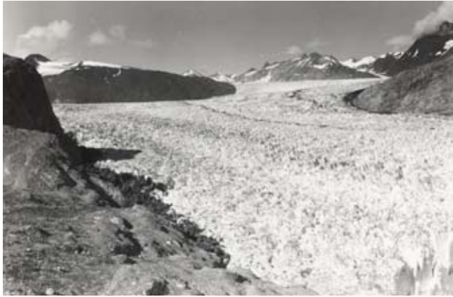
Muir Glacier in 1941

different subject areas such as these sets about global warming and child labor.