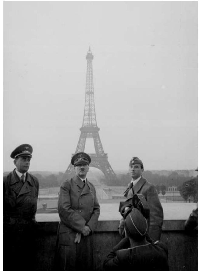
Adolf Hitler in Paris

Subjects have been moved, and negatives cropped and retouched, for every imaginable purpose from enlightening to misleading the viewer. Alexander Gardner, a Civil War photographer, carried a dead body to a more picturesque location to evoke poignancy and pity in his audience http://memory.loc.gov/ammem/