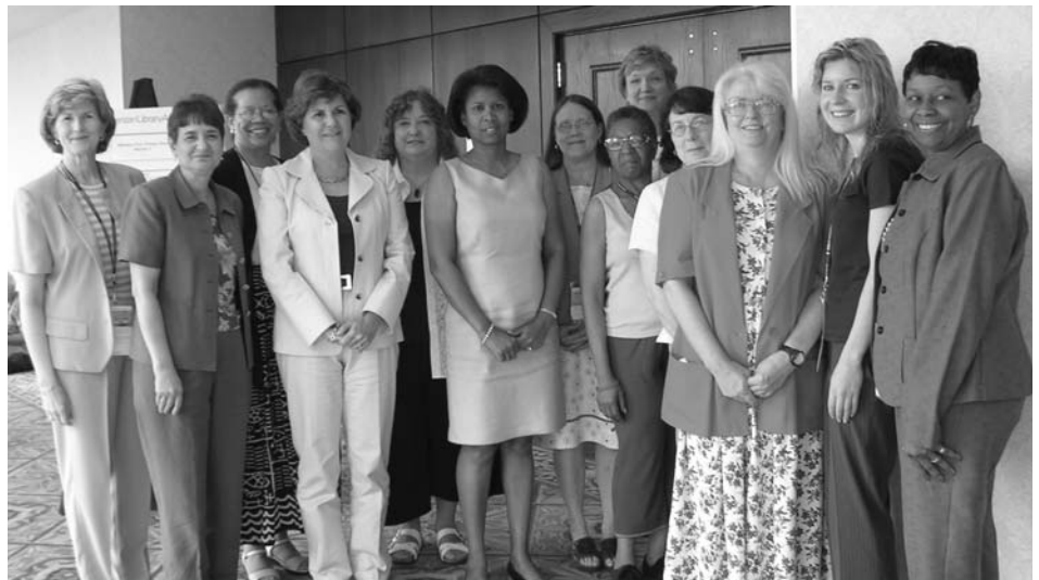
FAFLRT Board Members at the Annual Meeting in New Orleans