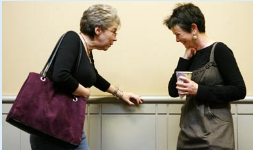
Best-selling authors Mary Doria Russell, left, and Geraldine Brooks, right, discuss their latest works backstage before the ALA/ERT Author Forum.

ALSC Notable Children's Recordings, Sunday, January 13, 8:00 – 10:00 p.m., had been CANCELLED.