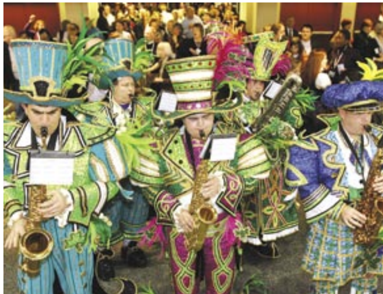
The Avalon String Band Mumpers lead the way into the Opening Reception on the Exhibit Floor at the ribbon cutting ceremony.

Saturday-Sunday: 9:00 a.m. – 5:00 p.m. Monday: 9:00 a.m. – 2:00 p.m.