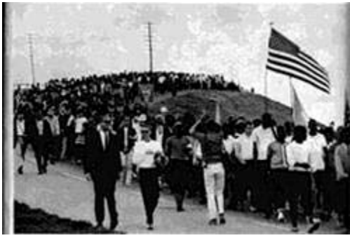
Day 1 of March to Montgomery

This article received “Highly Competent” scores on each element of the scoring rubric (see figure 5). Several of the elements exceeded requirements set forth in the scoring rubric, This article was more than the required one page length, the bookmark list had several types of information with multiple sources that answered the question words, the entire article was accurate and engaging, the pictures matched the accompanying text, and topic sentences were supported with specific details.