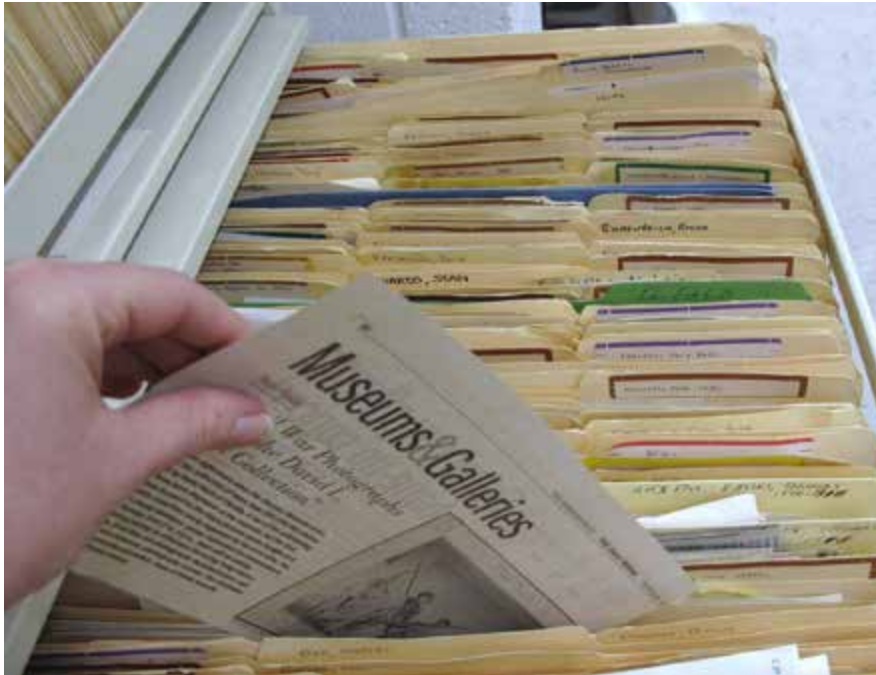
Figure 1. Librarian's 20th-century curation tool: vertical file.