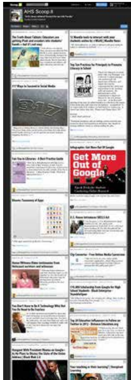
Figure 4. Colleagues’ 21st-century curation tool: Scoop.it online magazine.

you simply scan the information pulled from the various sources specified in your account, and then sort, rank, and arrange the content provided to engage your targeted audience. I have created two Scoop.it “magazines,” one for my school and one for school librarians: www.scoop.it/t/ahs-scoop-it and www.scoop.it/t/school-libraries (see figure 4).